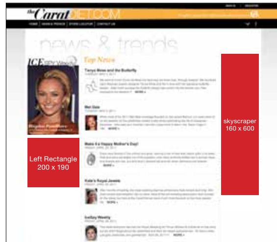
News and Trends